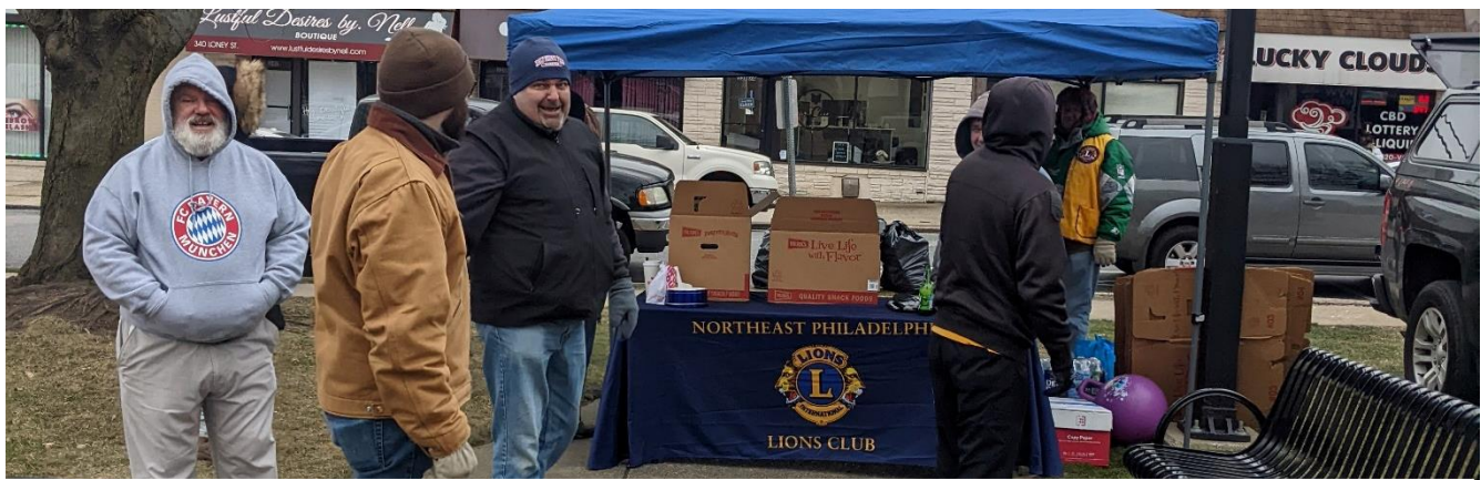
Another busy month for the Knights! Collecting food for tornado victims in Kentucky with the Lions. They were happy for our help!