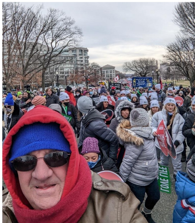
Knights always show up in force to help the unborn.

We also joined other Knights across the country in Washington for the March for Life. Also bitter cold but for a great cause. EWTN stated that the March for Life could not happen without the Knights of Columbus. Being personally involved with the March, I can attest to that fact. The Knights always show up in force to help the unborn.